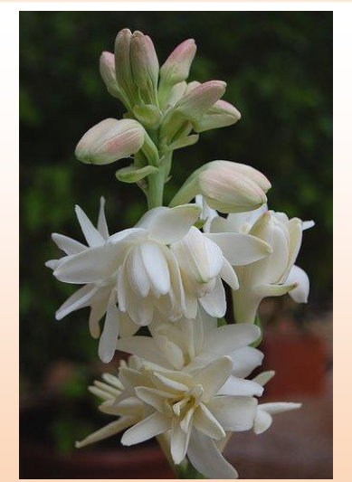
Perfect New Creation Clustered, manifold and complete, it asserts its right to be

For information: 09894778977/0413-2348067 sacar@auromail.net