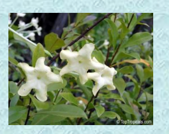
Resolution Nothing can stop its development

His laughter of beauty breaks out in green trees, His moments of beauty triumph in a flower; The blue sea's chant, the rivulet's wandering voice Are murmurs falling from the Eternal's harp.